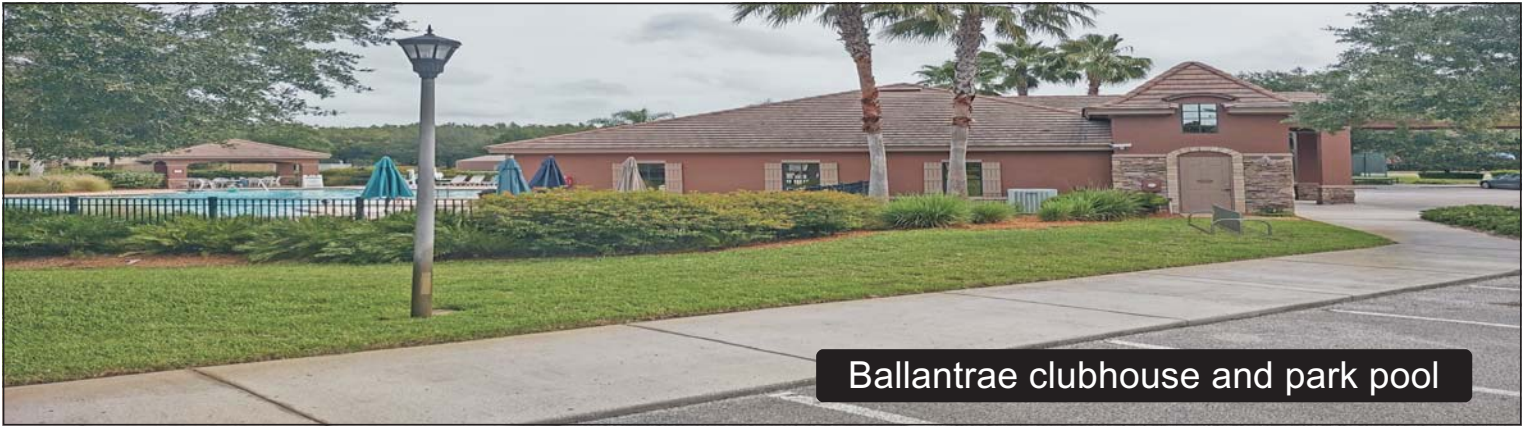
Ballantrae clubhouse and park pool