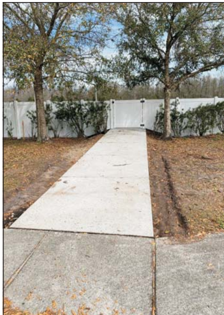
Moveable gate, sidewalk The county did not ask the CDD before ordering LeDantec builders to put in a gate and sidewalk (left) on CDD property, connecting its office building site with Ayrshire neighborhoods. After a request by the CDD Board, they were moved (above) onto county land.