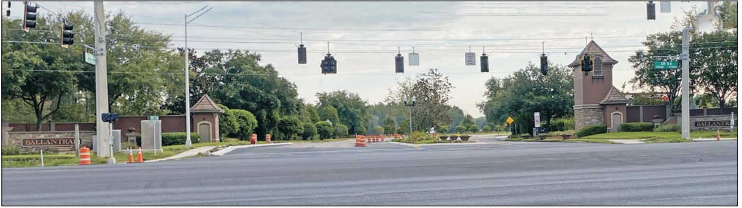
The Ferber Co. has finished laying the first coats of asphalt on expanded lanes at southbound Ballantrae Blvd. and SR 54.