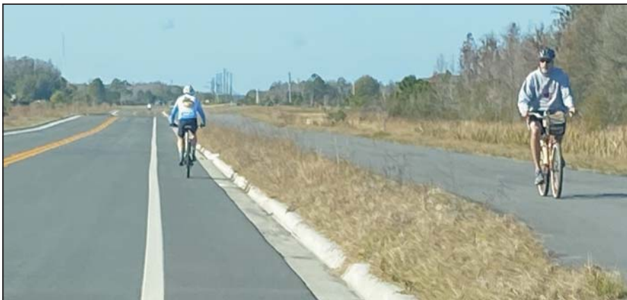
Tower Road to Sunlake Blvd. opens as Bud Bexley Parkway

DOH-Pasco asks individual who make appointments by phone to complete the screening and consent form prior to arriving. Consent forms are available on the DOH-Pasco COVID-19 Vaccination Distribution webpage .