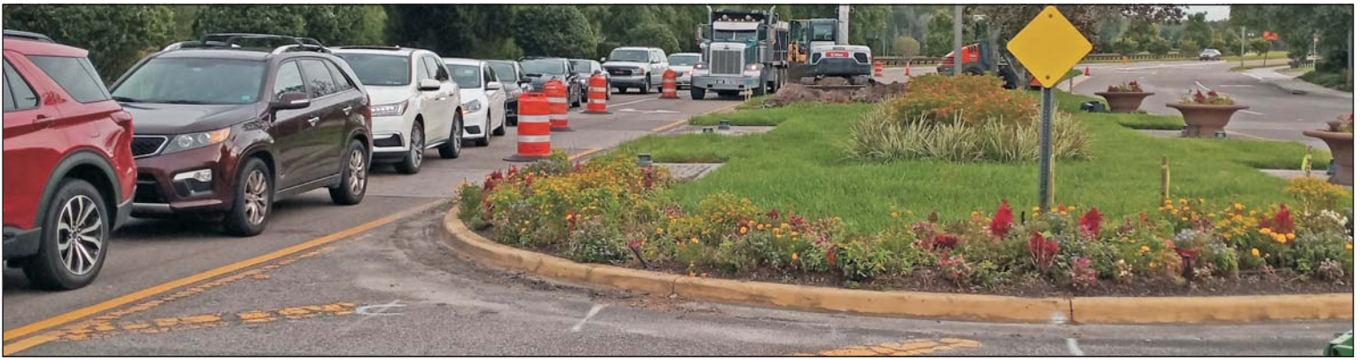
Construction causes vehicles exiting Ballantrae Blvd. southbound to back up, in this case, past the left turn into Aprile Drive and the Shoppes.