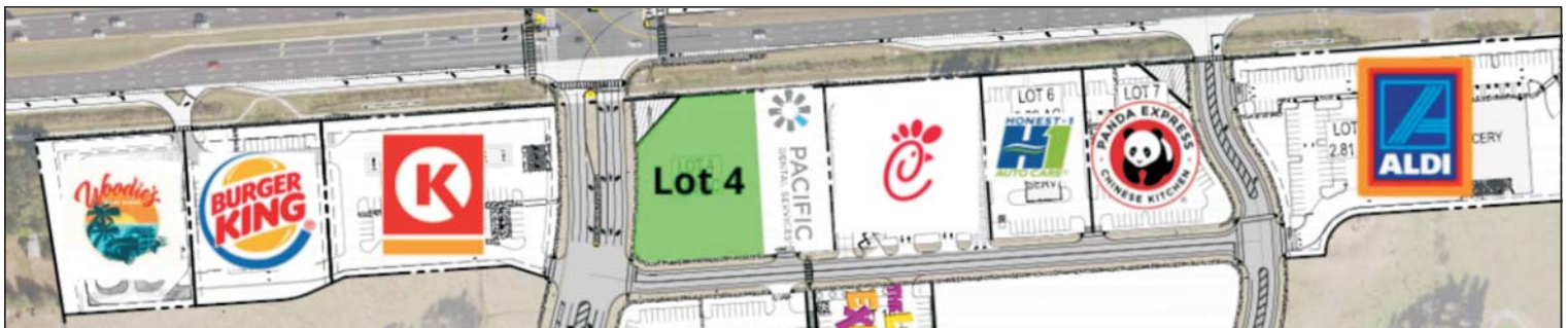
Businesses to be located along SR 54 across from Ballantrae include, from left, Woodie’s Wash Shack, Burger King, Circle K gas station, Pacific Dental Services, Chick-fil-A, Honest 1 Auto Care, Panda’s Express Chinese Kitchen and an Aldi grocery store. Lot 4 is untaken at the moment.

Email ballantrae@newsletteronline.info to subscribe to – or be removed from – receiving this posting.