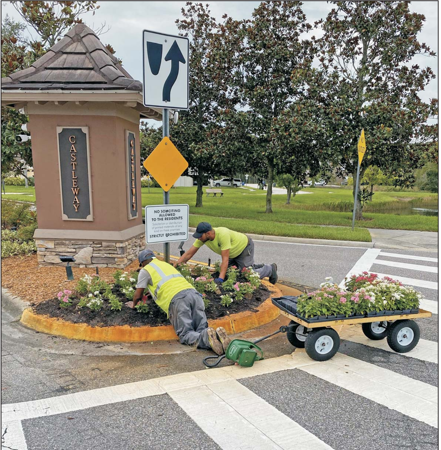
The CDD Board pays vendor Yellowstone Landscape to rotate main and six village entrance flora quarterly to keep their appearance fresh and brightly colorful. Photo shows the summer display being planted at Castleway on July 6.