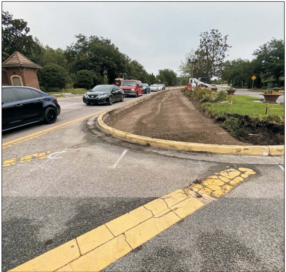
Reducing median width to add second left exit turn lane.

He accepted an invite to speak about the project at the CDD’s Wednesday, July 28 meeting at 6:30 p.m. at the clubhouse.