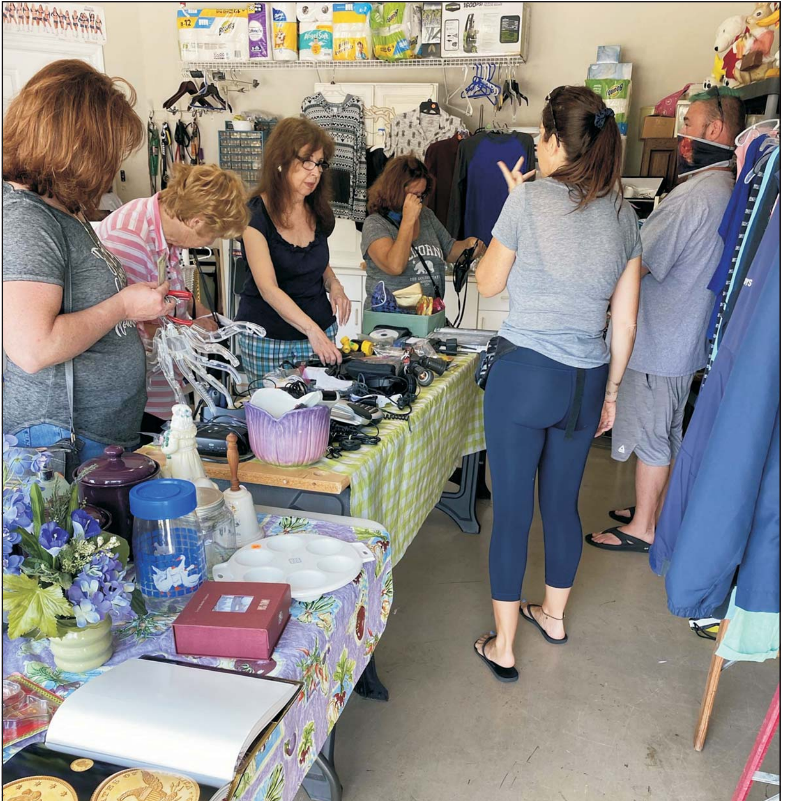
Customers lined up to enjoy and buy the wares available during Ballantrae's April 10 community garage sale. See more photos on page 6 .