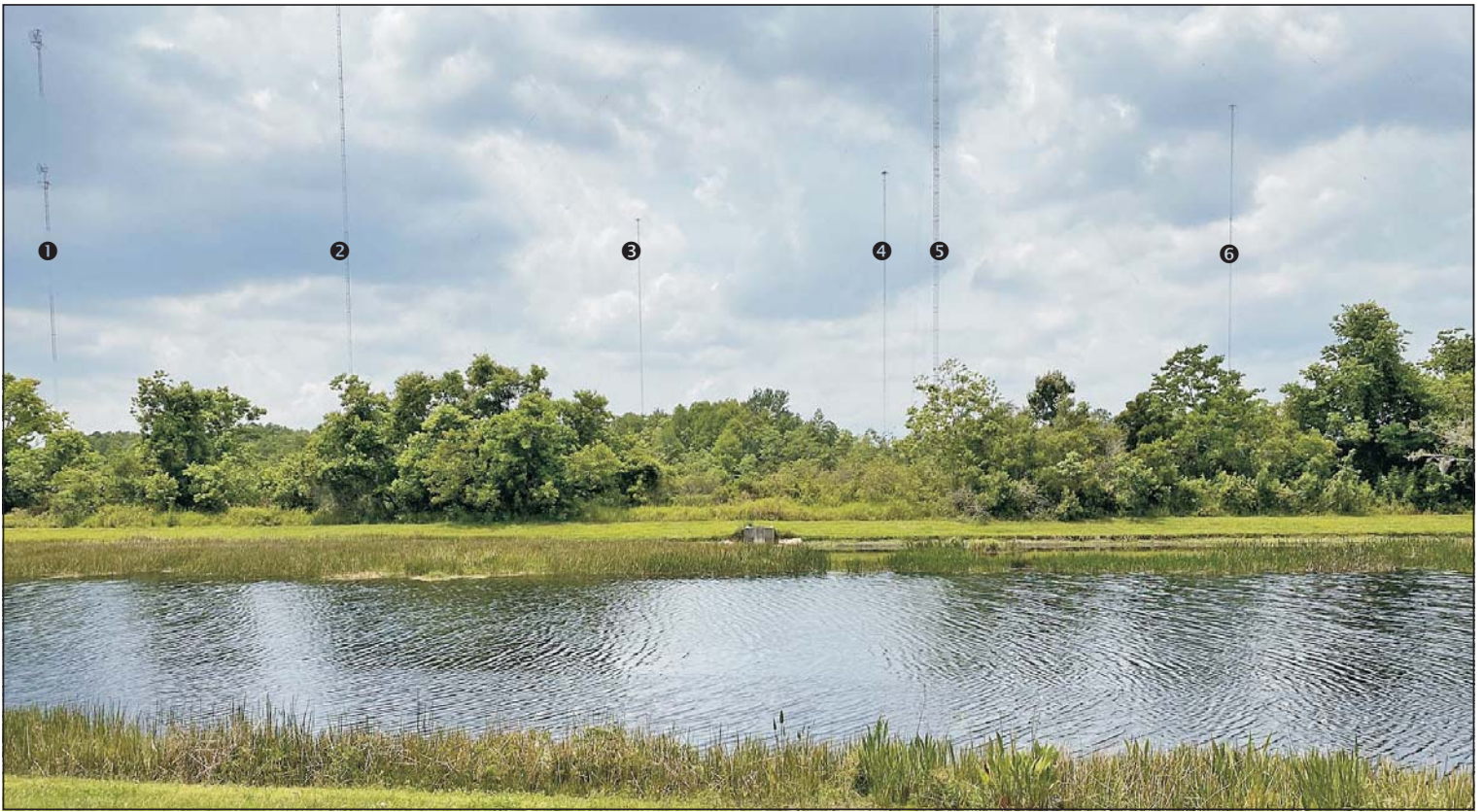
View is from Beneraid Street backyard facing west toward Salem property with its six radio towers (best viewed on-screen). The mowed lawn along the far shoreline is Ballantrae CDD property, as are some of the trees. The rest are Salem's. It is not yet known how this view will change, if at all.