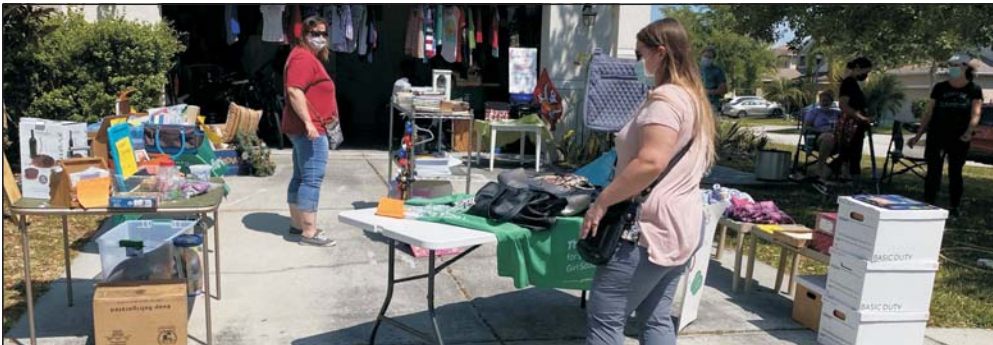
Photo at left shows the only live advertising team out on the street April 10 to stop traffic and redirect it to the Ballantrae community garage sale. They are members of Girl Scout Troop 2408. Above, other scouts and supporters staff a garage sale to raise funds for the troop. Remaining photos are from throughout Ballantrae.