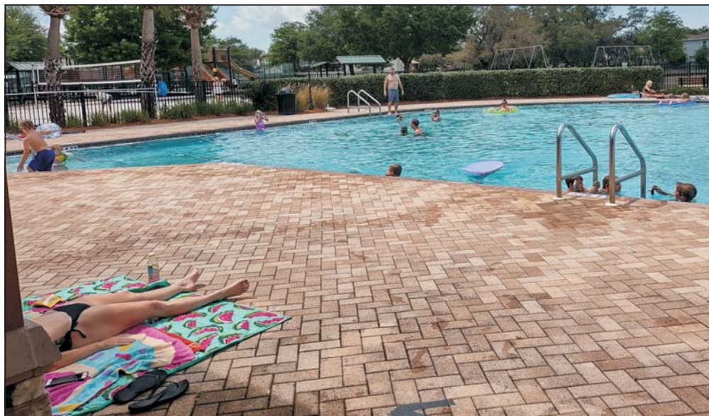
Repairs have been completed at both the park pool and splash pad so both are open daily. Repairs are completed at the CDD pool in Straiton which reopens May 10.

Now, the CDC says, families can sit together. That means a family of six, for example, need no longer occupy six X's. They can move chairs together and only occupy 2-3 X's. That leaves 3-4 X's for others to occupy, thus raising capacity at both pools.