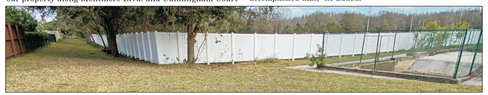
Fence leg at right runs south separating ponds shown above from Ballantrae. Fence leg at left runs behind Cunningham Court homes, with a strip of CDD property shown separating them from the fence. CDD storm water structure is at right.

site, a good job with the whole project, and be a good corporate neighbor to Ballantrae, and still have something we think works from a financial point of view. And I think we've accomplished that," he added.