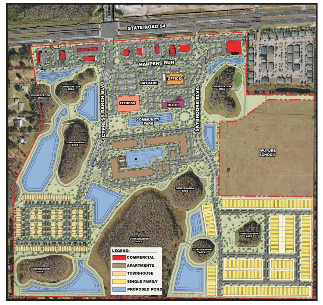
Graphic provided by Ferber Co., developer of Cypress Ranch across SR 54 from Ballantrae.

Send any story ideas, questions or comments on the Onliner to the editor at iflateau@ballantraecdd.org.